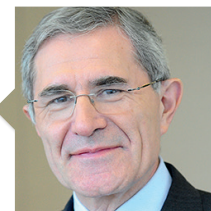
Gérard Mestrallet CHAIRMAN OF PARIS EUROPLACE

"Now more than ever, it is crucial for the financial sector to step up its contribution to the fight against climate change. The 50 ClimActs of Finance for Tomorrow are a great example of the ambition of the Paris Financial Center to be a global leader in terms of green and sustainable finance."